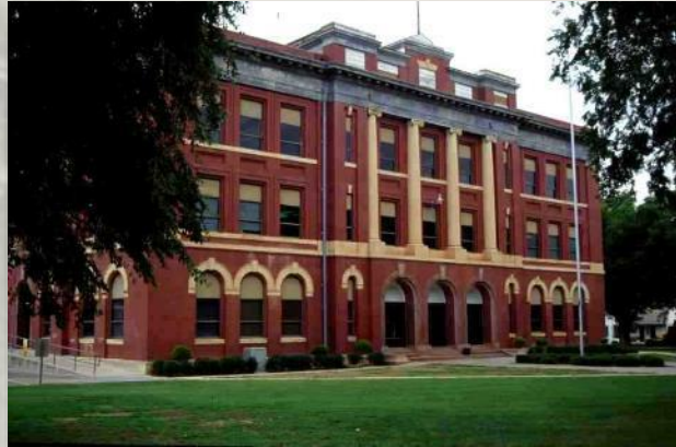
Greer County Courthouse, Greer County