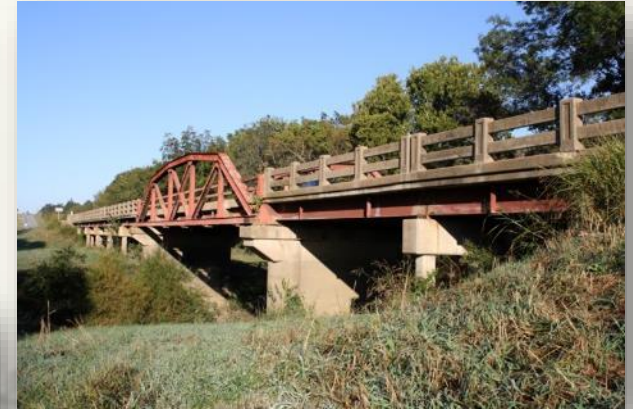
Little Cabin Creek Bridge, Craig County