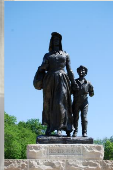
Pioneer Woman Statue, Kay County