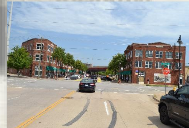
100 Block North Greenwood Avenue, Tulsa County